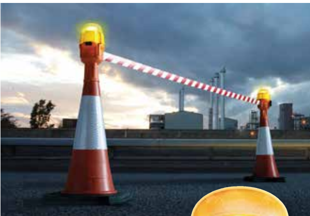
Product shown with additional accessories, available separately.