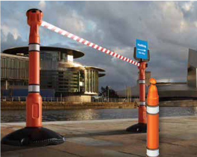
Product shown with additional accessories, available separately.