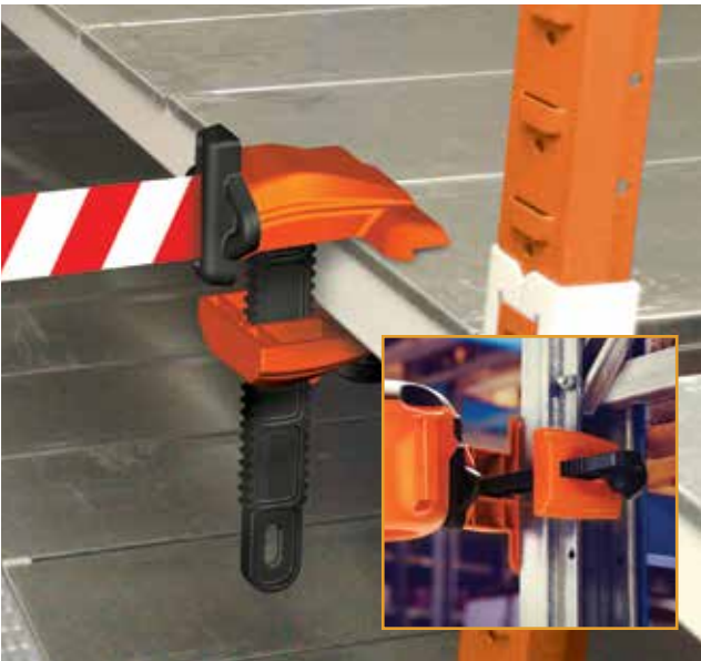
Product shown with additional accessories, available separately.