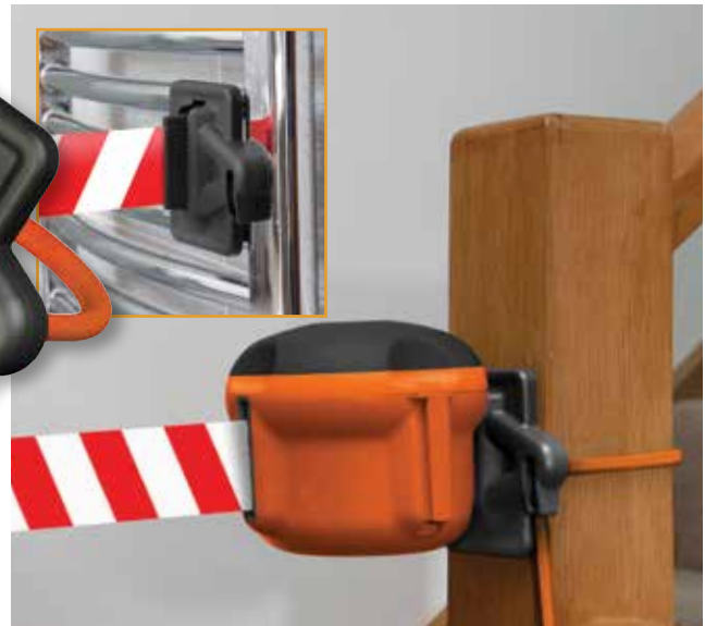
Product shown with additional accessories, available separately.