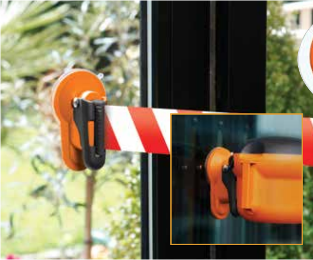
Product shown with additional accessories, available separately.