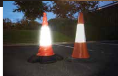
The Skipper cone's light reflectivity is twice as strong as a standard cone.